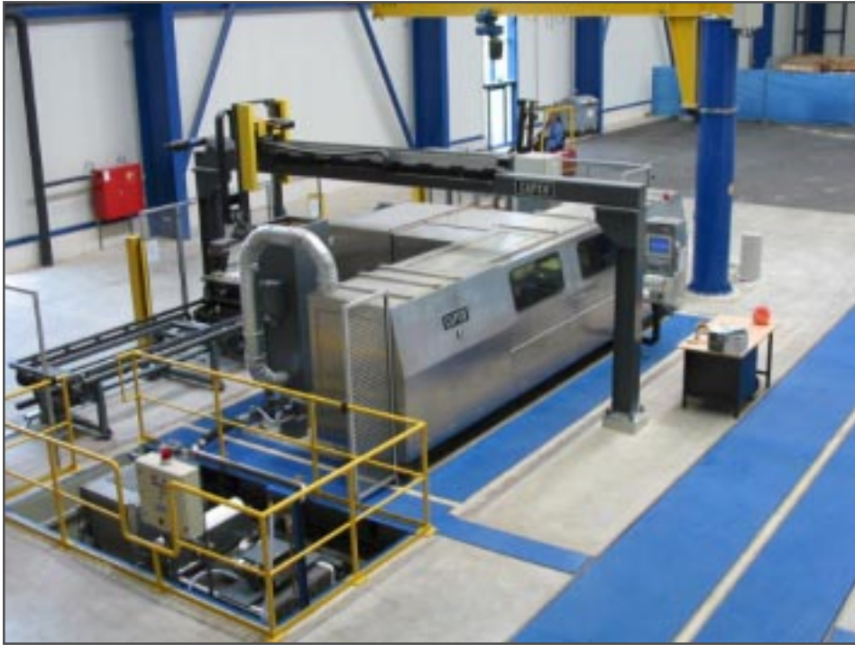
Capco® SuperGrinder™ Model TT.1408.CNC at Thyssen Krupp Nirosta in Dillenburg, Germany

The results are markedly different from past practices with all rolls now having the consistency that the mill requires, with lower costs and faster and more accurate roll throughput.